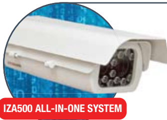
IZA500 ALL-IN-ONE SYSTEM