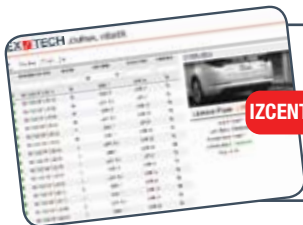
IZCENTRAL FOR LiNC-NXG™ SOFTWARE