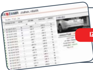
IZCENTRAL FOR Milestone XProtect