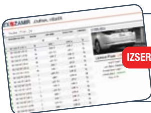
IZSERVER FOR LiNC-NXG™ SOFTWARE