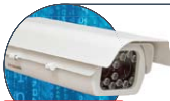
IZA500 ALL-IN-ONE SYSTEM