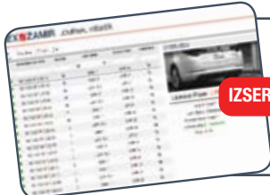
IZSERVER FOR OCULARIS™ SOFTWARE