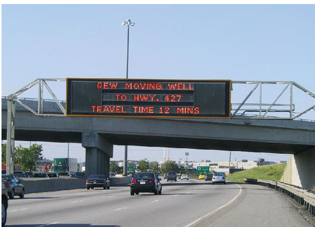
IZTRAVELTIME Deployed Within The Traffic Management System In Vancouver, BC, Canada

INEX/ZAMIR's IZTRAVELTIME TRAFFIC MANAGEMENT SOLUTION , employing the world's premiere vehicle identification technology, presents the best combination of accuracy and reliability in integrated automatic license plate recognition for travel time traffic management systems in the world.