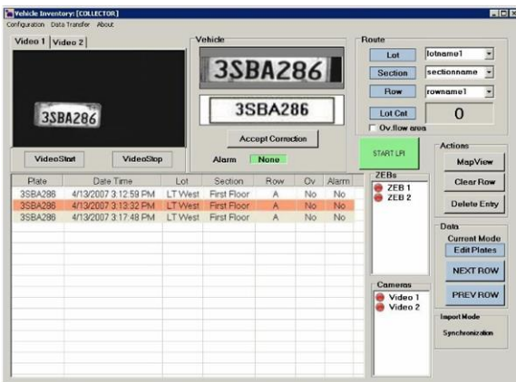
IZParking-Mobile System Interface

IZPARKING-MOBILE VEHICLE INVENTORY SYSTEM presents the best combination of speed and accuracy in automated parking lot inventory management in the world. As the acknowledged vehicle identification solution standard for vehicle inventory by license plate recognition, INEX/ZAMIR'S IZPARKING-MOBILE SYSTEM is the complete solution every vehicle inventory operation needs for revenue fraud reduction.