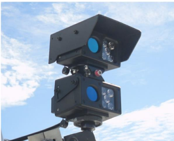
IZParking-Mobile Solution Imagers In Stacked Configuration

Let us know how INEX/ZAMIR can help your organization with your parking inventory management needs today.