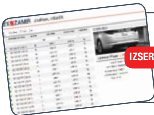
IZSERVER FOR 3VR VISIONPOINT SOFTWARE