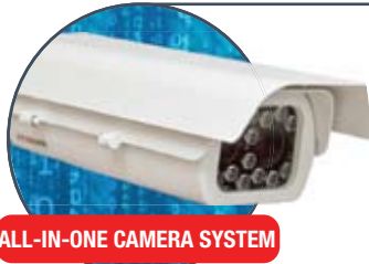
ALL-IN-ONE CAMERA SYSTEM